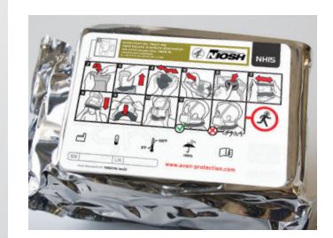
The Avon NH15 contains a quick-don label to guide user in an emergency situation.