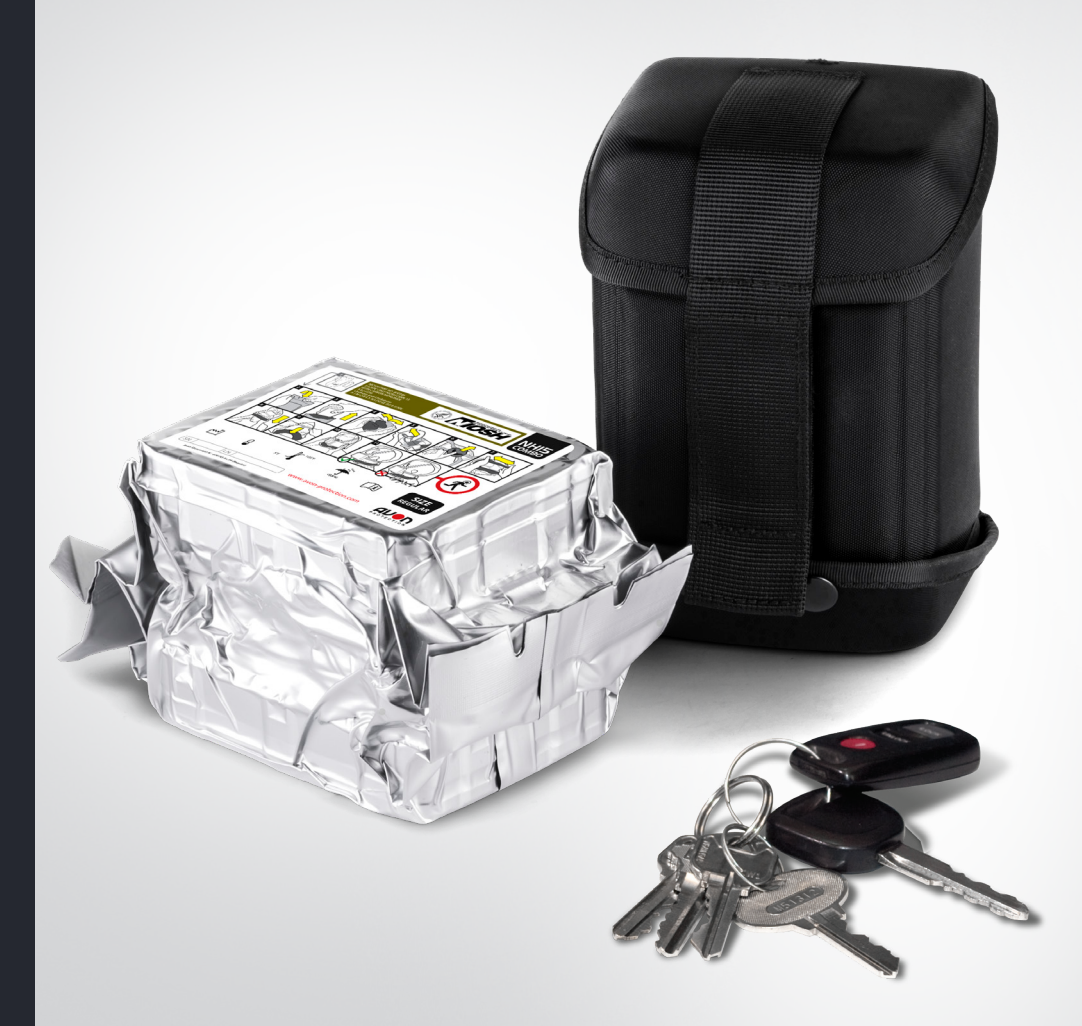
*The image above represents the NIOSH Standard Carrier